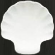
Shell Dish 6173 Av. Diameter 15.5 cm x 5 cm Av. Weight 212 g