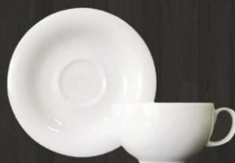
Breakfast Cup 7379 Saucer 7377 Av. Volume 360 ml Av. Weight 572 g