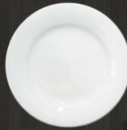
Salad Plate 5411 Av. Diameter 22 cm Av. Weight 340 g