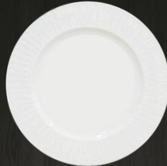
27" Dinner Plat 4220 Av. Weight 680 g Av. Diameter 28 cm