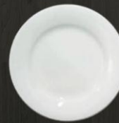
Bread & Butter Plate 5412 Av. Diameter 18 cm Av. Weight 218 g