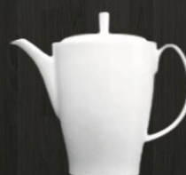
Small Coffee Pot 4652 Av. Volume 1 530 ml Av. Weight 920 g