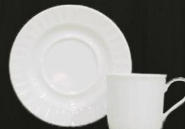
Medium Cup 4299 Saucer 4297 Av. Weight 155 g / 190 g Av. Volume 190 ml Av. Diameter 15 cm