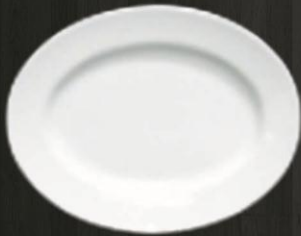
Oval Platter 4644 Av. Diameter 26 cm Av. Weight 1130 g