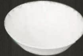
Large Salad Bowl 7209 Av. Diameter 23.2 cm Av. Weight 720 g