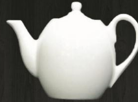
Tea Pot 2723 Av. Volume 410 ml Av. Weight 264 g