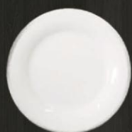
Dinner Plate (Sml) 7315 Av. Diameter 26 cm Av. Weight 670 g