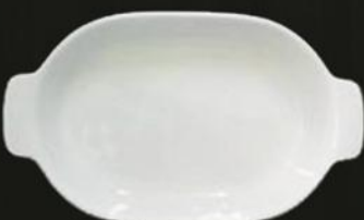
Lasagne Ovenware Medium 6145 Dimension : 32 cm x 19 cm Weight 1060 g