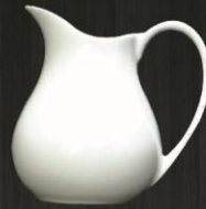
Creamer 128 Av. Volume 141 ml Av. Weight 135 g