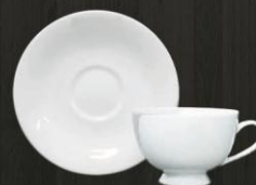
Moka Cup 0892 Saucer 0893 Av. Volume 120 ml Av. Weight 200 g