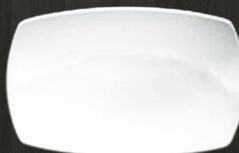
Oval Platter 4845 Av. Length 34 cm Av. Weight 1000 g