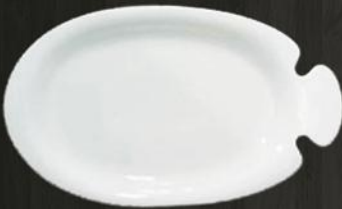
Fish Platter Small 6136 Av. Diameter 38 cm x 25 cm Weight 1030 g