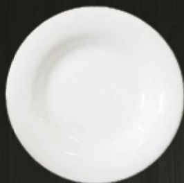
Chop plate 7325 Av. Diameter 30.6 cm Av. Weight 1020 g