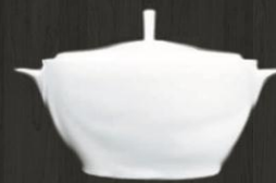
Covered Vegetable Bowl 4639 Av. Volume 2000 ml Av. Weight 980 g