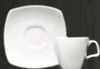
Mocca Cup & Saucer 4892/4893 Av. Volume 90 ml Av. Weight : 100g /115 g