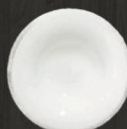
Soup Plate 7310 Av. Diameter 23 cm Av. Weight 550 g