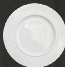
Dessert Plate Round 6611 Av. Dimensions 22 cm Av. Weight 380 g