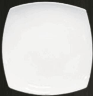
Chop plate 4825 Av. Diameter 31 cm Av. Weight 1,150 g