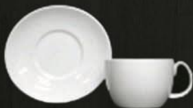
Breakfast Cup 4779 Saucer 4777 Av. Volume 450 ml Av. Dimensions 17.5 cm Weight 540 g