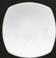
Soup Plate 4808 Av. Diameter 21 cm Av. Weight 610 g