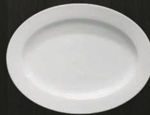
Platter 0545 Av. Dimensions 30 cm Av. Weight 760 g