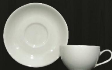
Tea Cup 3689 Saucer 3687 Av. Volume 300 ml Av. Weight 340 g