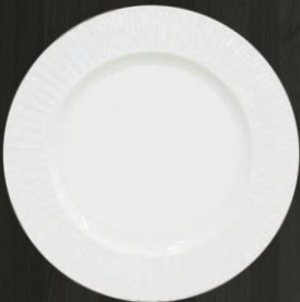
Salad Plate 4211 Av. Weight 360 g Av. Diameter 21 cm