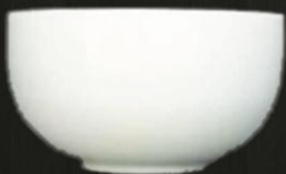
Salad Bowl 5450 Av. Diameter 21 cm Av. Volume 2770 ml Av. Weight 970 g