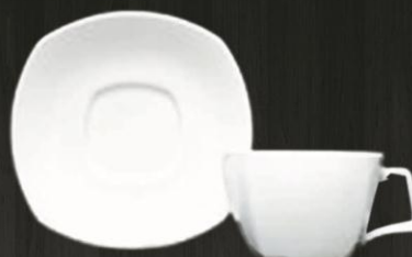
Breakfast Cup & Saucer 4879 / 4877 Av. Volume 400 ml Av. Weight 252 g