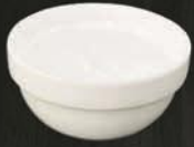
Flaired Dish 4" 3054 Av. Diameter 5.9 cm Av. Volume 35 ml Av. Weight 41.5 g