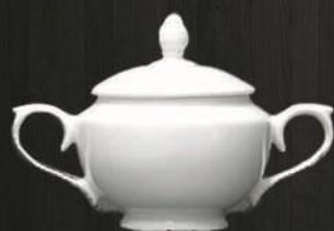
Sugar Bowl 1727 Av. Volume 340 ml Av. Weight 240 g