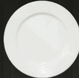
Dinner Plate 7220 Av. Diameter 27.4 cm Av. Weight 680 g