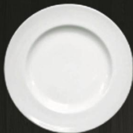
Charger Plate 3925 Av. Diameter 31 cm Av. Weight 910 g