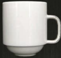
Mug 6686 Av. Volume 360 ml Av. Weight 240 g