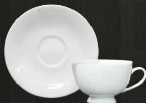
Tea Cup 0889 Saucer 0887 Av. Volume 245 ml Av. Diameter 16 cm Weight 330 g