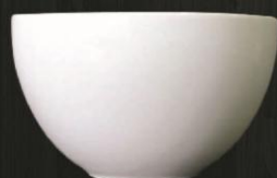
Non Stackable Bowl 7350 Av. Volume 750 ml Av. Weight 435 g