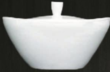
Soup Tureen with Lid 4729 Av. Volume 2860 ml Av. Weight 1990 g