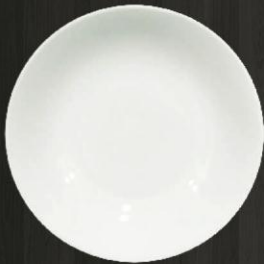
Coup Soup Plate 3608 Av. Diameter 21.5 cm Av. Weight 453 g