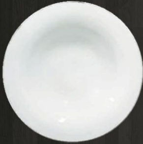
Pasta Plate 5476 Av. Diameter 27 cm Av. Weight 680 g