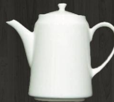
Tea Pot 4523 Av. Volume 336 ml Av. Weight 305 g