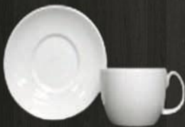
Tea Cup 4789 Saucer 4787 Av. Volume 240 ml Av. Dimensions 15 cm Weight 360 g