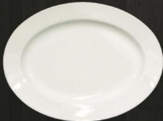
12" Oval Platter 4545 Av. Diameter 300 mm Av. Weight 795 g