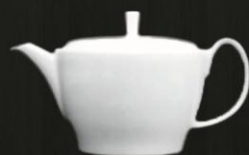
Tea Pot 4623 Av. Volume 1 300 ml Av. Weight 720 g