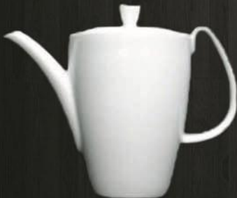
Coffee Pot 4753 Av. Volume 1400 ml Av. Weight 1000 g