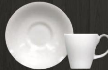
Moka Cup 4693 Saucer 4692 Av. Volume 90 ml Av. Weight 230 g