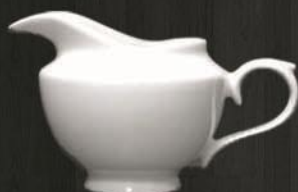
Creamer (Milk jug) 1728 Av. Volume 315 ml Av. Weight 230 g