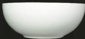
Large Salad Bowl 3609 Av. Volume 2652 ml Av. Diameter 23.7 cm Av. Weight 1065 g