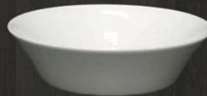
Large Salad Bowl 0509 Av. Dimensions 23 cm Av. Weight 680 g