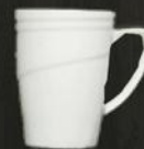
Mug 4188 Av. Diameter 16.5 m Av. Weight 450 g