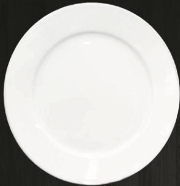
Chop plate 325 Av. Diameter 310 mm Av. Weight 1024 g