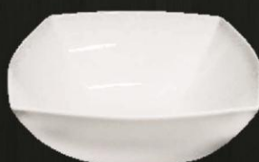
Large Salad Bowl 4809 Av. Diameter 24 cm Av. Weight 1130 g