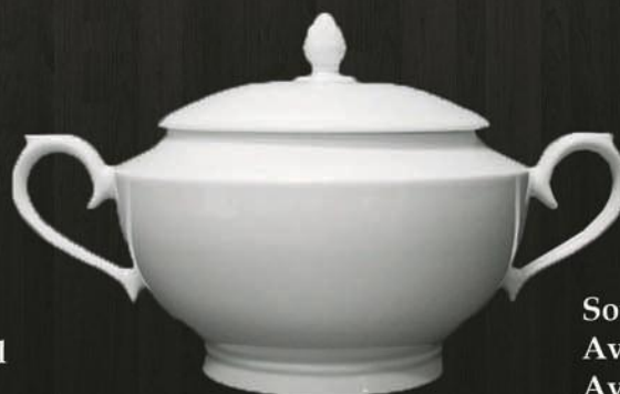
Soup Tureen 1729 Av. Volume 3470 ml Av. Weight 1490 g