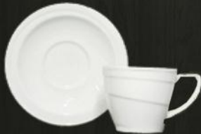
Breakfast Cup 4179 Saucer 4177 Cup Av. Volume 387 ml Av. Weight 461 g