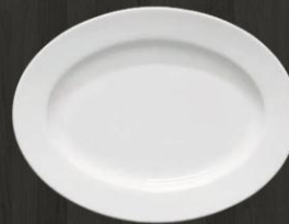
12" Platter 0545 Av. Diameter 30 cm Av. Weight 760 g