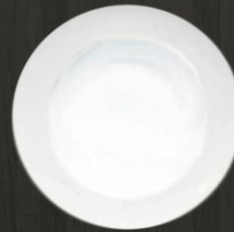
Pasta Bowl 0610 Av. Diameter 27 cm Av. Weight 760 g