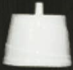
Sugar Bowl 4127 Av. Volume 290 ml Av. Diameter 7.66 cm Av. Weight 250.9 g