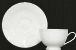
Coffee Cup 3392 Saucer 7293 Av. Volume 110 ml Av. Weight 198 g