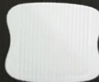
Asparagus Setter 6170 Av. Diameter 25 cm x 21 cm Av. Weight 1030 g