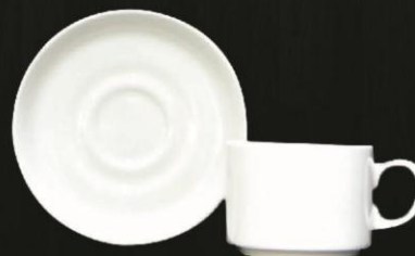
Tea Cup & Saucer 397/387 Cup Av. Volume 260 ml Av. Weight 390 g