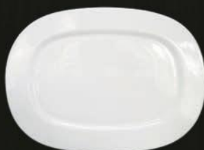
Platter 8044 Av. Diameter 36 cm Av. Weight 1000 g