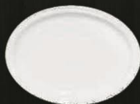
Oval Platter 4143 Av. Diameter 40.2 cm Av. Weight 1326 g