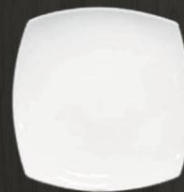
Salad Plate 4811 Av. Diameter 21 cm Av. Weight 440 g