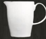
Milk Pitcher 4651 Av. Volume 810 ml Av. Weight 440 g