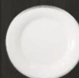
BB Plate 7312 Av. Diameter 18.1cm Av. Weight 320 g