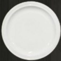
Salad Plate 4111 Av. Diameter 21.6 cm Av. Weight 357 g