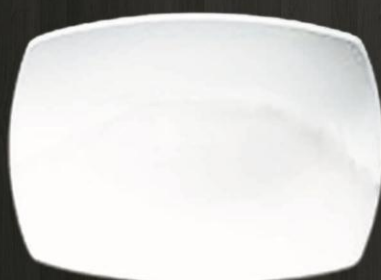
Large Platter 4844 Av. Length 36 cm Av. Weight 1500 g