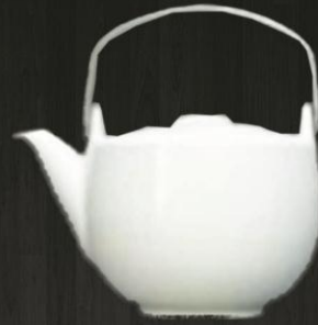
Tea Pot 5423 Av. Volume 1390 ml Av. Weight 770 g