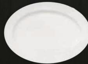
14" Oval Platter 7244 Av. Diameter 35 cm Av. Weight 1205 g