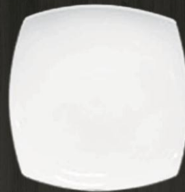
Dinner Plate 4820 Av. Diameter 27 cm Av. Weight 850 g