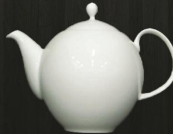
Coffee Pot 3653 Av. Volume 2260 ml Av. Weight 1190 g