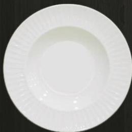
Rim Soup Plate 4210 Av. Weight 490 g Av. Diameter 23 cm