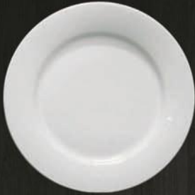
Chop Plate 0525 Av. Dimensions 31 cm Av. Weight 1000 g