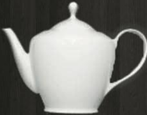
Tea Pot 3323 Av. Volume 1211 ml Av. Weight 680 g