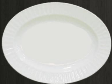
9" Platter 4246 Av. Weight 380 g Max Width 25 cm