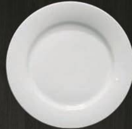
Dinner plate 0520 Av. Dimensions 27 cm Av. Weight 650 g