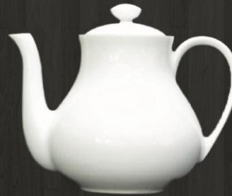
Tea Pot 233 Av. Volume 510 ml Av. Weight 340 g