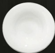
Plate Bowl 7376 Av. Diameter 30.7 cm Av. Weight 1050 g