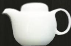
Tea Pot Small 6124 Av. Volume 650 ml Av. Weight 450 g