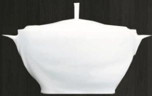
Soup Tureen 4629 Av. Volume 3430 ml Av. Weight 1232 g