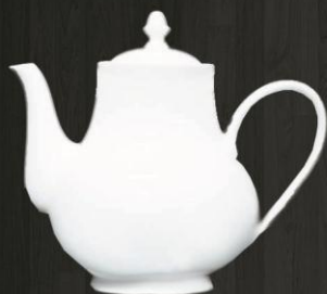
Tea Pot 0823 Av. Volume 1660 ml Av. Weight 815 g