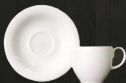
Demi Cup 7392 Saucer 7393 Av. Volume 90 ml Av. Weight 220 g