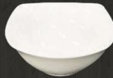
Portion Bowl Small 3506 Av. Diameter 14.2 cm Av. Volume 370 ml Av. Weight 241 g