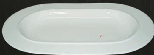
Oval Platter 6636 Av. Dimensions 39 cm - Length Av. Weight 1070 g