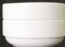
Stackable Bowl 7398 Av. Volume 570 ml Av. Weight 400g