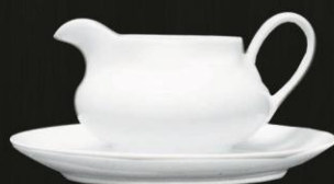
Sauce Boat & Setter 0842 / 0841 Av. Volume 600 ml Av. Weight 730 g