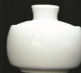
Sugr Bowl 1927 Av. Volume 225 ml Av. Weight 177 g