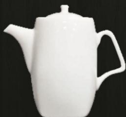
Tea Pot 4823 / 48232 Av. Volume 325 ml Av. Weight 670 g