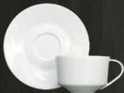
Tea Cup 8089 Saucer 8087 Av. Volume 270 ml Av. Weight 350 g