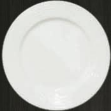
Salad Plate 7211 Av. Diameter 21.8cm Av. Weight 3457 g