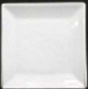
Square Plate 4912 Av. Diameter 15cm x 15cm Av. Weight 295 g