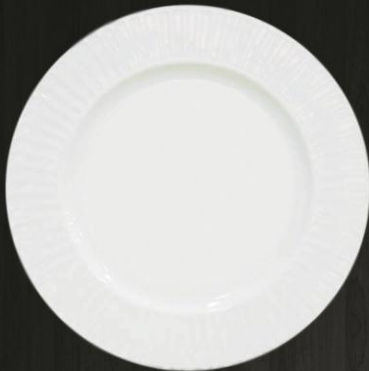
30" Chop Plate 4225 Av. Weight 1035 g Av. Diameter 32 cm