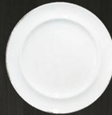
Salad Plate 6111 Av. Diameter 22 cm Av. Weight 350 g