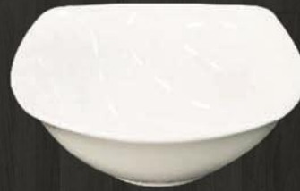
Portion Bowl (L) 3509 Av. Diameter 22.6 cm Av. Volume 1310 ml Av. Weight 738 g