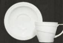
Coffee Cup 4192 Saucer 4193 Av. Volume 90 ml Av. Weight 200 g