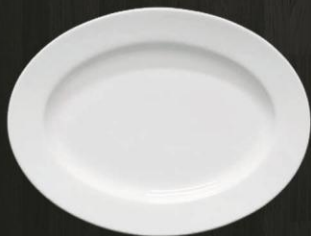
14" Platter 0544 Av. Diameter 35 cm Av. Weight 1200 g