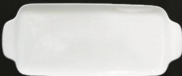
Rectangular Tray 6149 Av. Diameter 36 cm x 16 cm Av. Weight 750 g