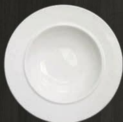
Deep Plate Round 6610 Av. Dimensions 23 cm Av. Weight 440 g