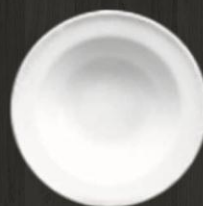
Rim Soup plate 4610 Av. Diameter 22 cm Av. Weight 450 g