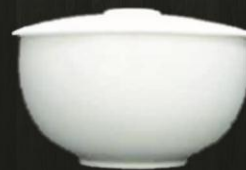
Deep Bowl with lid 5456 Av. Diameter 17 cm Av. Volume 1600 ml Av. Weight 980 g