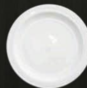
Bread & Butter Plate 4112 Av. Diameter 17.8 cm Av. Weight 242.2 g