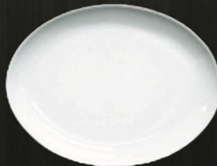
Oval Platter 4744 Av. Dimensions 36 cm Av. Weight 1240 g