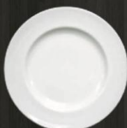
BB Plate 3912 Av. Diameter 18 cm Av. Weight 215 g