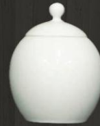
Sugar Bowl 3627 Av. Volume 350 ml Av. Weight 240 g