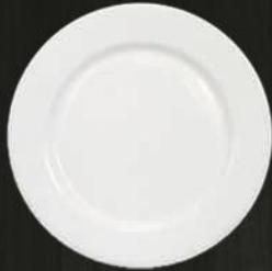
Dinner Plate 8020 Av. Diameter 28 cm Av. Weight 700 g