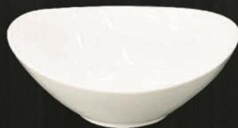
Portion Bowl Oval (L) 4707 Av. Diameter 16 cm Av. Volume 500 ml Av. Weight 390 g