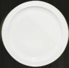
Chop plate 4125 Av. Diameter 30.8 cm Av. Weight 864 g