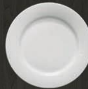
BB Plate 0512 Av. Dimensions 16 cm Av. Weight 200 g