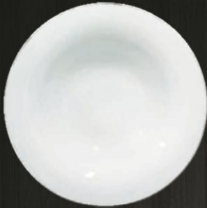
Large Deep Plate 5466 Av. Diameter 33 cm Av. Weight 1100 g