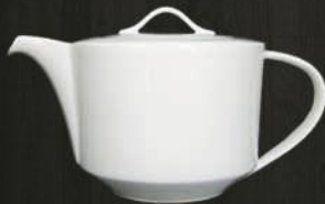
Tea Pot 8023 / 8023 Av. Volume 1200 ml Av. Weight 760 g