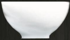
Salad Bowl 4609 Av. Volume 2350 ml Av. Weight 1354 g