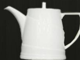
Tea Pot 4123 Av. Volume 1140 ml Av. Diameter 9.45 cm Av. Weight 770 g