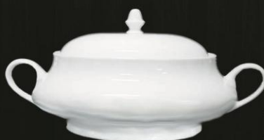
Soup Tureen (Small) 0829 Av. Volume 2000 ml Av. Weight 1240 g