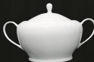
Soup Tureen (Large) 0929 Av. Volume 3700 ml Av. Weight 1765g