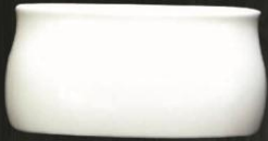
Sugar Sachet Holder 0127 Av. Weight 157 g