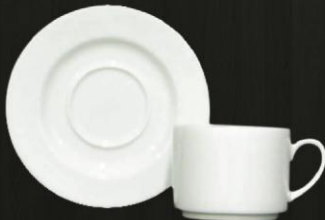
Tea Cup 4589 Saucer 4587 Cup Av. Volume 170 ml Av. Weight 288 g