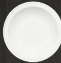
Rim Soup Plate 4110 Av. Diameter 21.5 cm Av. Weight 432 g