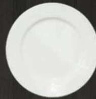
BB Plate 7212 Av. Diameter 16.3cm Av. Weight 200 g