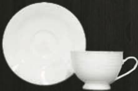
Tea Cup 3389 Saucer 7287 Av. Volume 250 ml Av. Weight 360 g