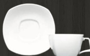
Tea Cup & Saucer 4889/4887 Av. Volume 220 ml Av. Weight : 178 g / 186 g