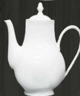
Coffee Pot 0853 Volume 1800 ml Weight 840 g