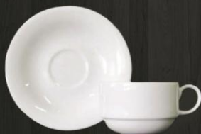
Stackable Cup 7399 Saucer 7387 Av. Volume 250 ml Av. Weight 472 g