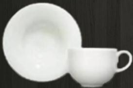
Tea Cup 5489 Saucer 5487 Av. Weight 270 g Av. Volume 250 ml