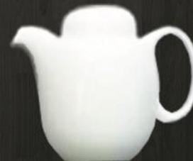
Coffee Pot 6153 Volume 1170 ml Weight 650 g