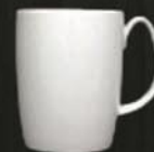
Tea Mug 4788 Av. Volume 430 ml Av. Weight 310 g