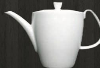
Tea Pot 4723 Dimensions 13.4 cm Volume 1280 ml Weight 940 g