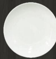
BB Plate 3162 Av. Diameter 16.3 cm Av. Weight 204 g