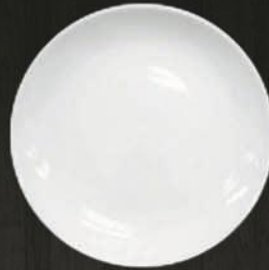
Dinner Plate 4720 Av. Dimensions 27 cm Av. Weight 650 g