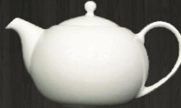
Tea Pot 3623 Av. Volume 1380 ml Av. Weight 690 g