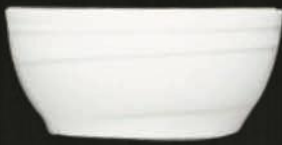
Large Salad Bowl 4109 Av. Volume 2310 ml Av. Weight 1167 g