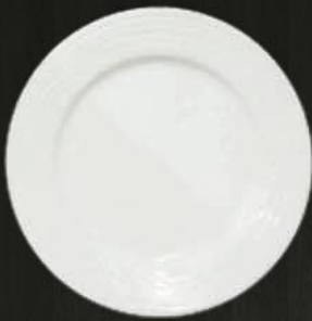
Chop plate 7225 Av. Diameter 30.5 cm Av. Weight 952 g