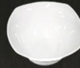
Fruit Saucer 3506 Av. Diameter 2 cm Av. Weight 740 g