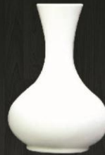
Bottle Vase 0337 Av. Height 134 cm Av. Weight 222 g