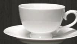
Tea Cup 1889 Saucer 0887 Av. Volume 245 ml Av. Weight 330 g