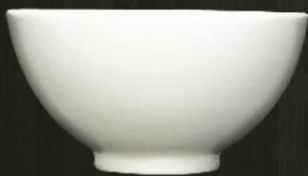
Rice Bowl (Large) 250 Av. Diameter 144 mm Av. Weight 345g Av. Volume 610 ml