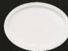
Oval Platter 4145 Av. Diameter 31.9 cm Av. Weight 720 g