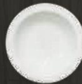
Fruit Nappy 4106 Av. Diameter 10.61 cm Av. Weight 77 g