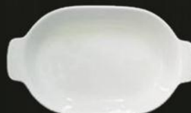
Lasagne Ovenware Small 6146 Av. Diameter 27 cm x 16 cm Weight 730 g