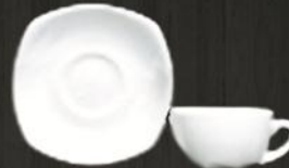
Tea Cup 3689 Saucer 3587 Av. Volume 300 ml Av. Weight 320 g