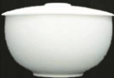
Soup Tureen with Lid 5429 Av. Diameter 25 cm Av. Volume 4270 ml Av. Weight 2280 g