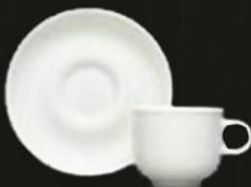
Tea Cup 6189 Saucer 6187 Av. Volume 200 ml Av. Diameter 14 cm (Saucer) Weight 320 g