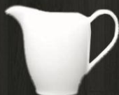
Creamer (Milk Jug) 0928 Av. Diameter 23 cm Av. Weight 184 g