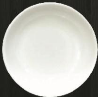
Flaired Dish 4" 0254 Av. Diameter 8.3 cm Av. Weight 77 g Av. Volume 80 ml