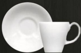
Demi Cup 4682 Saucer 4683 Av. Volume 132 ml Av. Weight 300 g