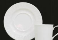
Coffee Cup 4292 Saucer 4293 Av. Weight 80 g / 100 g Av. Volume 80 ml Av. Diameter 12 cm