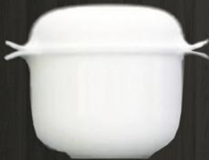
Covered Vegetable Bowl 6139 Av. Volume 1700 ml Av. Diameter 15 cm Av. Weight 620 g