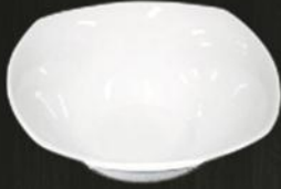
Salad Bowl 3509 Av. Diameter 23 cm Av. Weight 740 g