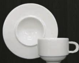
Tea Saucer 6687 Cup with Handle 6689 Av. Volume 210 ml Av. Weight 370 g