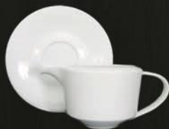
Sauce Boat & Stand 8041 Av. Volume 580 ml Av. Weight 388 g / 280 g