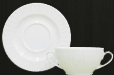
Soup Cup 4298 Setter 4277 Av. Weight 250 g Av. Volume 390 ml Av. Diameter 17 cm