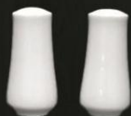
Pepper Shaker 0601 Salt Shaker 0602 Av. Height 10 cm Av. Weight 100 g