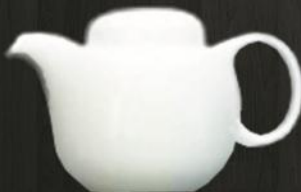
Tea Pot Large 6123 Volume 1100 ml Weight 660 g