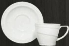
Tea Cup 4189 Saucer 4187 Av. Volume 265 ml Av. Weight 368 g