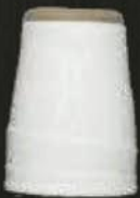
Sugar Can 4163 Av. Volume 588 ml Av. Weight 590 g