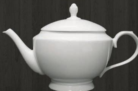
Tea Pot 1723 Av. Volume 1 615 ml Av. Weight 850 g