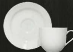
Tea Cup 3399 Saucer 7297 Av. Volume 250 ml Av. Weight 336 g