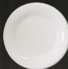
Dinner Plate 7320 Av. Diameter 28.5 cm Av. Weight 810 g