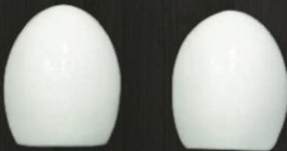
Salt & Pepper Shaker 3601/3602 Av. Weight 80 g/84 g