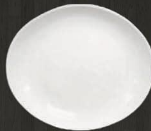
Oval salad Plate 4747 Av. Dimensions 23 cm Av. Weight 415 g