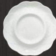
Artichoke Dish 6100 Av. Diameter 23 cm Av. Weight 560 g