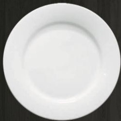
Dessert Plate 0511 Av. Diameter 21 cm Av. Weight 330 g