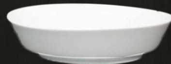
Baker 0538 Av. Diameter 25 cm Av. Weight 660 g