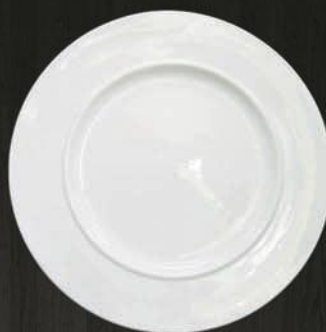
Flat plate Round 6620 Av. Dimensions 28 cm Av. Weight 670 g