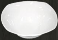
Cereal Bowl 3507 Av. Diameter 18 cm Av. Weight 480 g