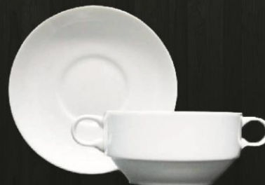
Soup Cup & Setter 398/277 Cup Av. Volume 325 ml Av. Weight 530 g