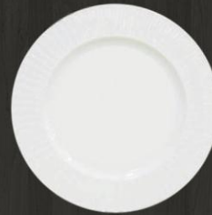
Bread & Butter Plate 4212 Av. Weight 190 g Av. Diameter 16 cm