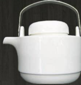
Tea Pot With Stainless Steel Handle 6623 Volume 1260 ml Weight 890 g