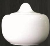
Sugar Bowl 7327 Av. Volume 300 ml Av. Weight 260 g