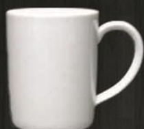
Mug (Large) 0688 Volume 300 ml Weight 260 g