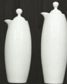
Vinegar 3661 Oil Bottle 3662 Av. Volume 205 ml Av. Diameter 4 cm