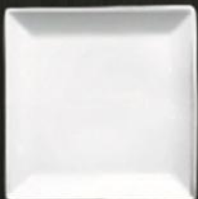
Square Plate 4911 Av. Diameter 20 cm x 20cm Av. Weight 480 g