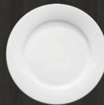
BB Plate 0512 Av. Diameter 16 cm Weight 200 g