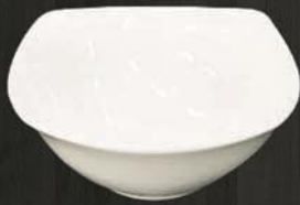
Portion Bowl (M) 3507 Av. Diameter 19.4 cm Av. Volume 710 ml Av. Weight 482 g