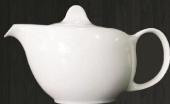
Tea Pot (Small) 7324 Av. Volume 500 ml Av. Weight 365 g