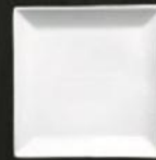
Square Platter 4925 Av. Diameter 12cm x 12cm Av. Weight 1370 g