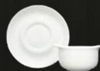
Bullion Cup & Saucer 6198 / 6196 Av. Volume 310 ml Av. Weight 350 g