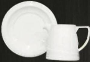
Cup 4142 Setter 4141 Av. Volume 550 ml Av. Height 11.15 cm Av. Weight 450 g