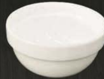
Chutney Bowl Medium 3055 Av. Diameter 7.3 cm Av. Volume 70 ml Av. Weight 67 g