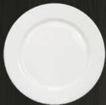
Salad Plate 8011 Av. Diameter 22 cm Av. Weight 390 g