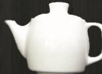
Tea Pot 0323 Av. Volume 536 ml Av. Weight 380 g