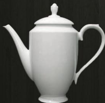
Coffee Pot 1753 Av. Volume 1525 ml Av. Weight 780 g