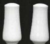
Pepper Shaker 0601 Salt Shaker 0602