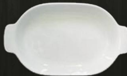
Lasagne Ovenware Large 6144 Av. Diameter 38 cm x 23 cm Weight 1630 g