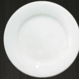
Dinner plate 5420 Av. Diameter 27 cm Av. Weight 590 g