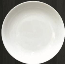
Large Salad Bowl 309 Av. Diameter 230 mm Av. Weight 640 g