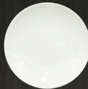
Dinner Plate 3620 Av. Diameter 26.6 cm Av. Weight 632 g