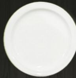
Dinner Plate 4120 Av. Diameter 26.2 cm Av. Weight 639 g