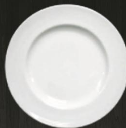
Dinner Plate 3920 Av. Diameter 27 cm Av. Weight 650 g