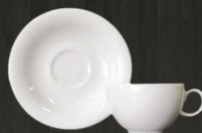
Non - Stackable Cup & Saucer 7387/7389 Av. Volume 205 ml Av. Weight 460 g