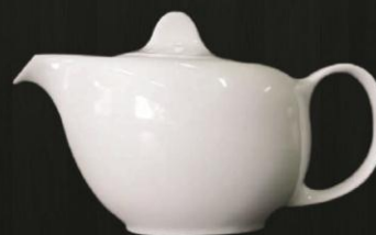
Tea Pot (Large) 7323 Av. Volume 1000 ml Av. Weight 570 g