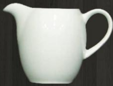
Creamer 3628 Av. Volume 280 ml Av. Weight 187 g