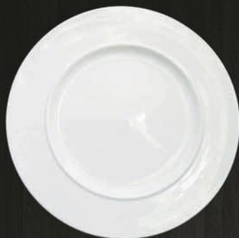
Under Plate 6625 Av. Dimensions 33 cm Av. Weight 1040 g