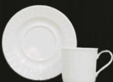
Mocha Cup 4282 Saucer 4283 Av. Weight 100 g / 140 g Av. Volume 110 ml Av. Diameter 13 cm