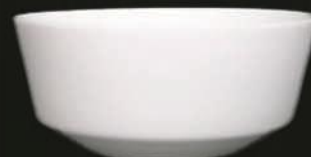
Large Bowl 8009 Av. Diameter 21 cm Av. Volume 1800 ml Av. Weight : 800 g