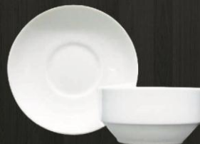
Soup Cup without Holder 0277 Av. Cup Volume 325 ml Av. Weight 532 g