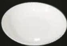
Cereal Bowl 7207 Av. Diameter 18.9 cm Av. Weight 365 g