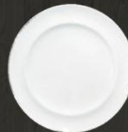
Bread & Butter Plate 6112 Av. Diameter 18 cm Weight 230 g