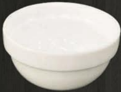
Chutney Bowl Large 3056 Av. Diameter 8.9 cm Av. Volume 155 ml Av. Weight 123 g