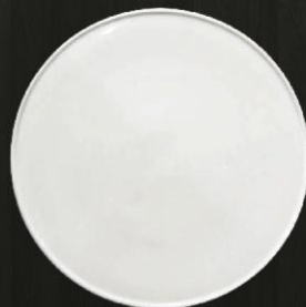
Cake Tray 0904 Av. Diameter 30.3 cm Av. Weight 1040 g