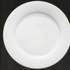
Flat Plate 0520 Av. Diameter 27 cm Av. Weight 650 g