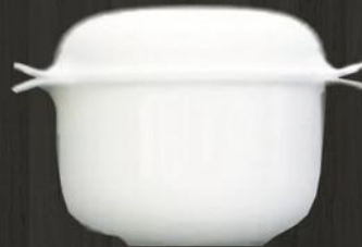
Soup Tureen 6129 Av. Volume 2850 ml Av. Diameter 18 cm Av. Weight 990 g