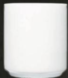
Mug Large 0688 Av. Volume 275 ml Av. Weight 235g