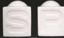
Pepper & Salt Shaker 6601/6602 Av. Weight 60 g