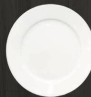
Salad Plate 0311 Av. Diameter 215 mm Av. Weight 375 g