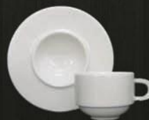
Mocca Saucer 6693 Cup With Handle 6692 Av. Volume 85 ml Av. Weight 230 g