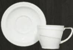
Demi Cup 4182 Saucer 4183 Cup Av. Volume 130 ml Av. Weight 260 g