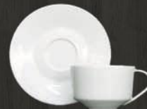
Coffee Cup 8082 Saucer 8093 Av. Volume 90 ml Av. Weight 160 g