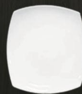
BB Plate 4812 Av. Diameter 16 cm Av. Weight 230 g