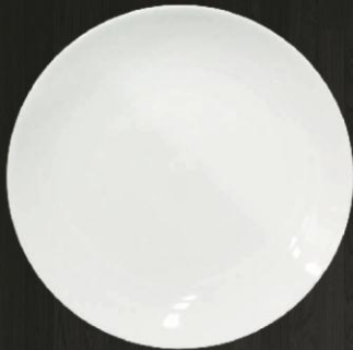
Chop plate 3625 Av. Diameter 30 cm Av. Weight 850 g