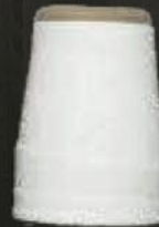
Biscuit Container 4164 Av. Volume 1975 ml Av. Weight 1023 g