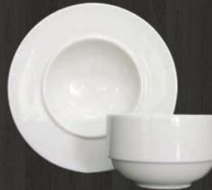
Small Bowl 6698 Saucer 6696 Av. Volume 340 ml Av. Weight 580 g