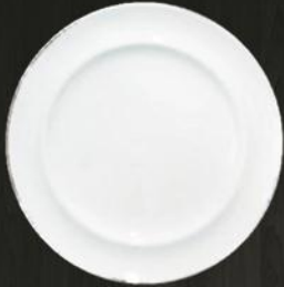
Dinner Plate 6120 Av. Diameter 28.5 cm Av. Weight 710 g