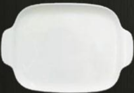
Square Platter Large 6169 Av. Diameter 34 cm x 23 cm Av. Weight 1040 g