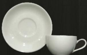
Coffee Cup 3692 Saucer 3693 Av. Volume 109 ml Av. Weight 302 g