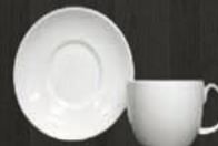
Coffee Cup 4792 Saucer 4793 Av. Volume 100 ml Av. Dimensions 12.5 cm Weight 220 g