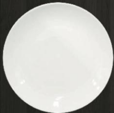
Salad Plate 3611 Av. Diameter 20.6 cm Av. Weight 360 g