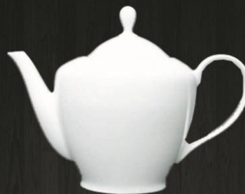
Tea Pot 0923 Av. Volume 1200 ml Av. Weight 700 g