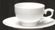
Mocca Cup 1892 Saucer 0893 Av. Volume 114 ml Av. Weight 200 g