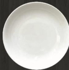
Fruit Nappy 306 Av. Diameter 145 mm Av. Weight 200 g