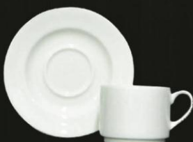
Coffee Cup 4592 Saucer 4593 Cup Av. Volume 90 ml Av. Weight 180 g