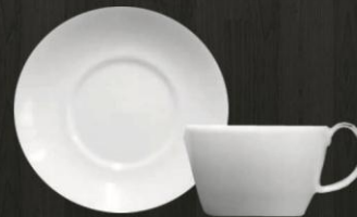
Tea Cup 4689 Saucer 4687 Av. Volume 275 ml Av. Weight 400 g