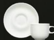
Mocca Cup & Saucer 6182 / 6183 Av. Volume 100 ml Av. Diameter 12.5 cm (Saucer) Av. Weight 340 g