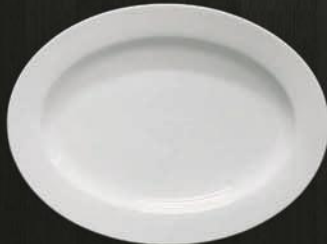
Platter 0544 Av. Dimensions 36 cm Length Av. Weight 1200 g