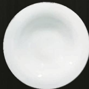
Rim Soup Plate 5410 Av. Diameter 22.6 cm Av. Weight 410 g