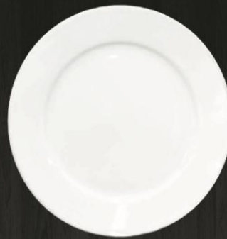
Dinner Plate 0320 Av. Diameter 273 mm Av. Weight 688 g