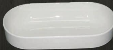
Oval Bowl 6638 Av. Dimensions 30 cm Av. Volume 1900 ml Av. Weight 1000 g