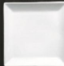
Square Plate 4920 Av. Diameter 25 cm x 25 cm Av. Weight 875 g