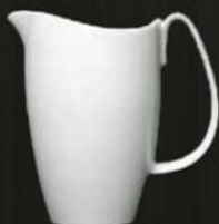
Milk Pitcher 4751 Av. Volume 900 ml Av. Weight 573 g