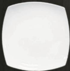
Meat Plate 4815 Av. Diameter 24.5 cm Av. Weight 853 g