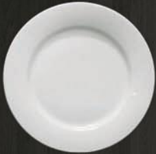
Salad Plate 0511 Av. Dimensions 21 cm Av. Weight 330 g