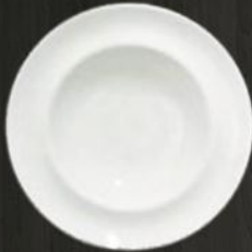
Soup Plate 6110 Av. Diameter 22 cm Weight 440 g