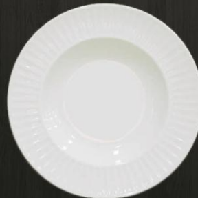
Large Rim Soup Plate 4230 Av. Weight 930 g Av. Diameter 29 cm