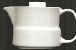
Tea Pot 1923 Av. Volume 605 ml Av. Weight 485 g