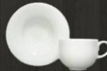
Mocca Cup 5482 Saucer 5483 Av. Weight 170 g Av. Volume 90 ml