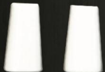
Pepper & Salt Shacker 0101 / 0102 Av. Height 44.5 cm