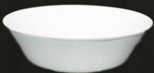
Large Salad Bowl 0509 Av. Diameter 23 cm Av. Weight 680 g