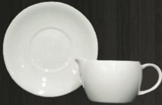
Gravy Boat 3642 Setter 3641 Av. Volume 600 ml Av. Diameter 6.5 cm Av. Weight 590 g