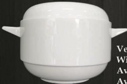
Vegetable Dish With Lid 6639 Av. Volume 1090 ml Av. Weight 700 g