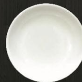
Flaired Dish 2.5" 0154 Av. Diameter 7.1 cm Av. Weight 37 g Av. Volume 50 ml