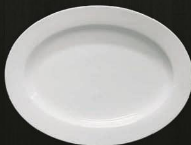
Platter 0543 Dimensions 41 cm Length Weight 1600 g