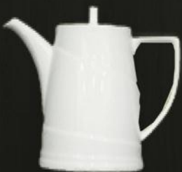
Coffee Pot 4153 Av. Volume 2240 ml Av. Diameter 8.45 cm Av. Weight 794 g