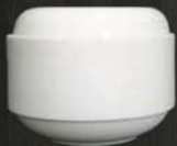
Sugar Bowl 6627 Av. Volume 340 ml Av. Weight 290 g