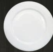
BB Plate 8012 Av. Diameter 18 cm Av. Weight 240 g