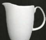
Creamer 4728 Av. Volume 330 ml Av. Weight 255 g