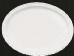
Oval Platter 4144 Av. Diameter 35.6cm Av. Weight 966 g